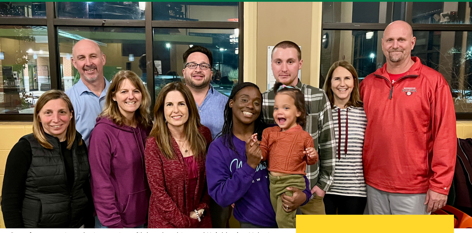
One of our recent graduates, center, with her daughter and Neighboring Volunteers